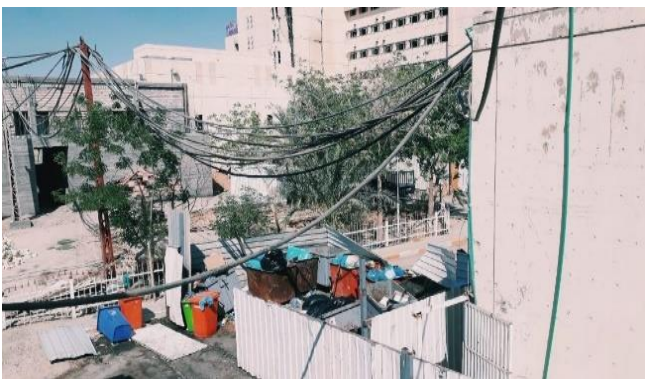
Fig. 1 Different colored plastic containers for waste separation at the point of origin