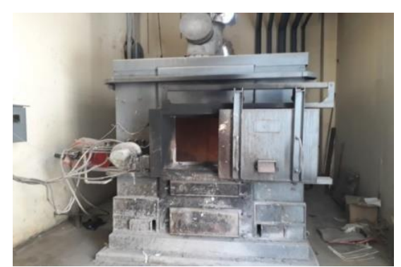
Fig. 4 Combustion single chamber